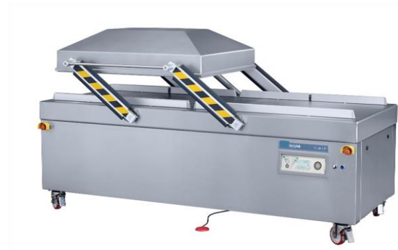
*with option automatic lid